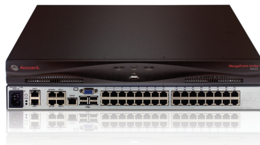
MergePoint Unity 32-port dual AC appliance