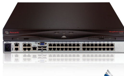
MergePoint Unity 32-port dual AC appliance