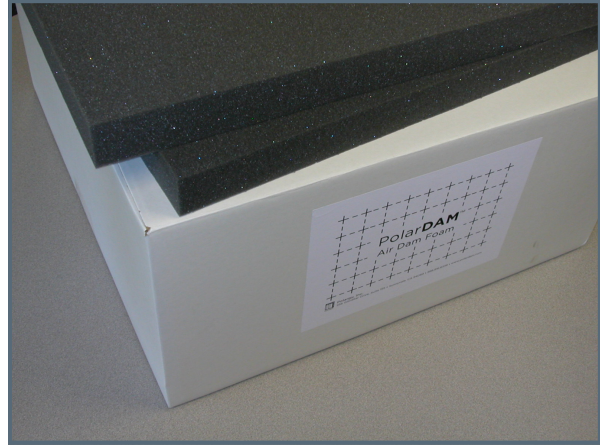
Easy to store 2'x2'x1' boxes, Part # = PD24